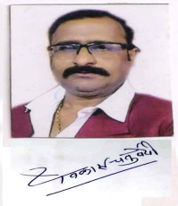
Competent person's Photograph